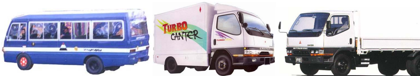
1 F.BUMPER W/O FOG LAMP COVER 2 FRONT BUMPER WITH FOG LAMP COVER 3 GRILLE CLEAR/AMBER SHORT TYPE